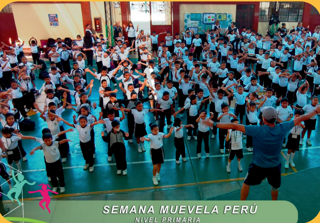
SEMANA MUEVELA PERÚ NIVEL PRIMARIA